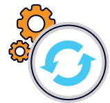
EXECUTION Page 10