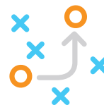
STRATEGY Page 9